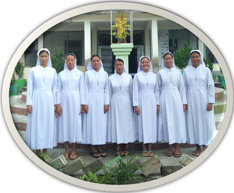
Second year Juniors